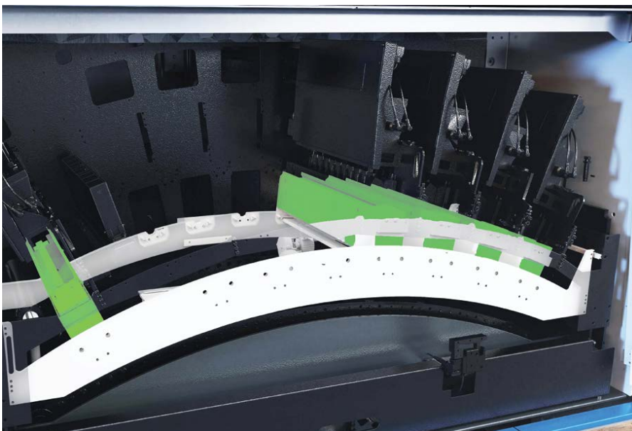
For cleaning, boxes with flood cleaning and ultrasonic cleaning units move under the fixed printheads