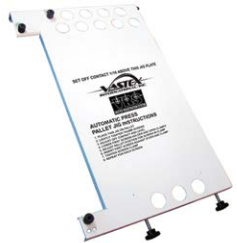
VASTEX's three-pin pallet jig