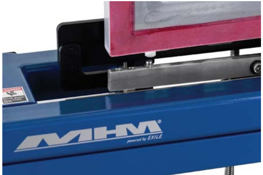
Above and below: Pin-registration system on the computer-to-screen MHM SPYDER II

Pre-press automation – specifically the 'digitalisation' of the screen room via the adoption of a CTS system – represents the biggest single step a medium or large