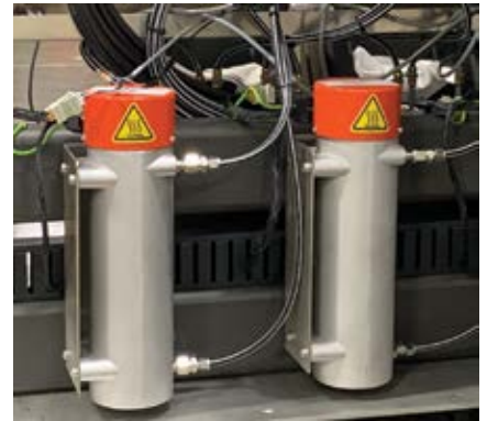
The VUTEK XT's robust, industrial ink delivery system is adapted from the company's successful Nozomi single-pass inkjet printer line

"In wide format, to some people 100 sheets is a huge run," said Ingram. "We're looking to get into runs of thousands of sheets, and that's where we think the XT can take us. It's that next-generation press that will offer much more speed. We're going to dedicate the XT press to rigid and basically try to extend that range where we're competitive in terms of quantity."