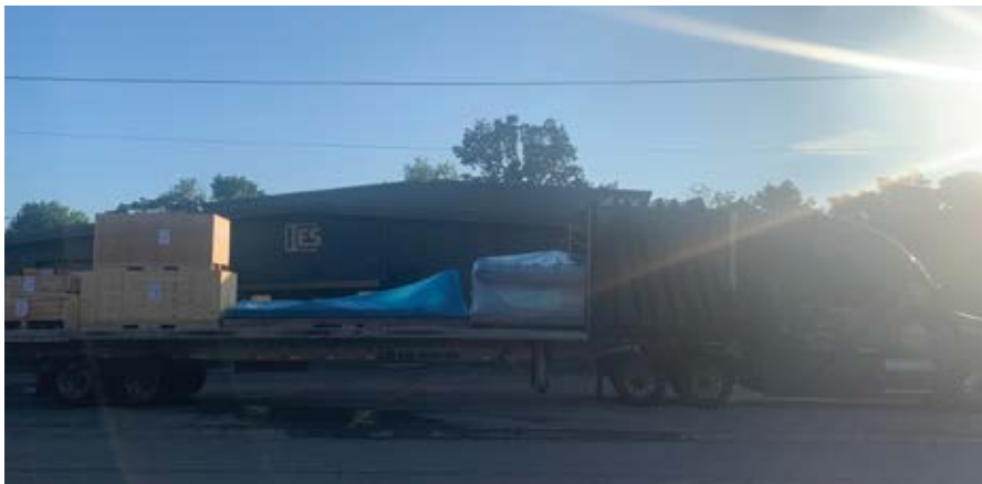
IES receiving an early-morning delivery of VUTEK XT components in August 2022

The VUTEK XT printer uses an enhanced dual-zone Pin & Cure technology, originally launched on EFI's VUTEK HS series platform. In the print zone, as the printheads jet ink droplets onto the substrate, LED lamps partially cure the ink and control the dot gain