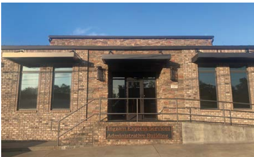
Digital graphics production Ingram Express Services has installed the world's first VUTEK XT