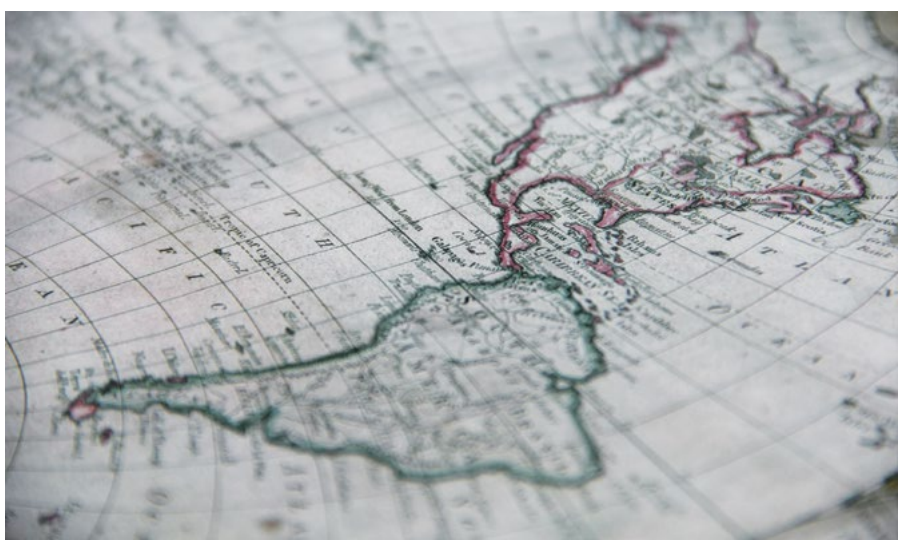
Comprised of Spanish and Portuguese-speaking countries within the American continent, Latin America has a population of 586 million people, and in 2017 the region contained 60,000 printing companies

Yet there is no shortage of state-of-theart graphics, with cutting-edge technology