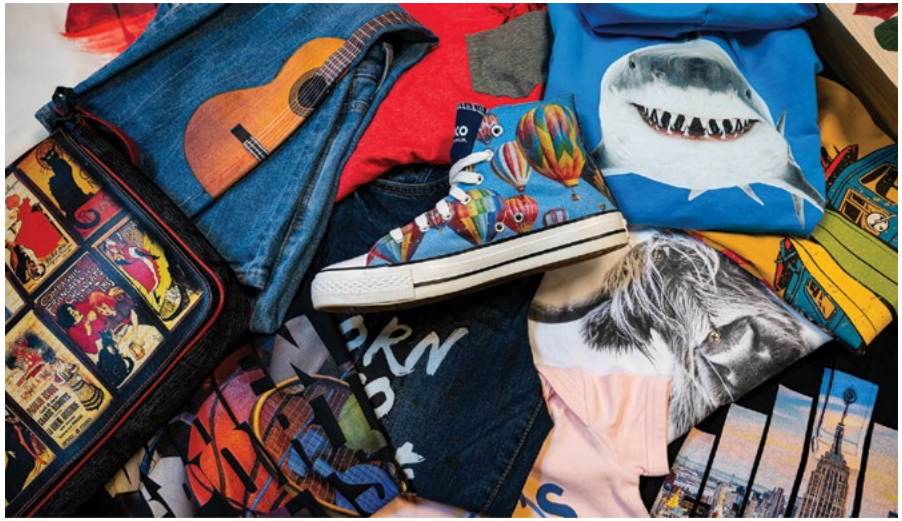
Designs remain well-preserved even after multiple washes when DTG printed

Another fact to keep in mind is the ecological footprint that is left when clothes are being manufactured. To create a t-shirt you use about 4,100 litres of water. By using the direct-to-garment printing technique to cut down on waste you can also conserve a lot of important resources.