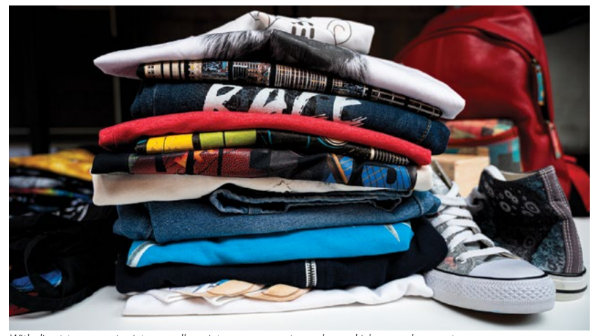
With direct-to-garment printers smaller print runs are easy to produce, which means less waste