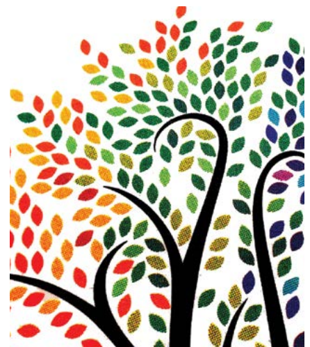
Plastisols and acryols contain plasticisers that cross-link with the plastic resin. These plasticisers don't evaporate off but become part of the ink film

The common misconception is that water-based inks are benign since they are largely water. Not so. All water-based inks contain a