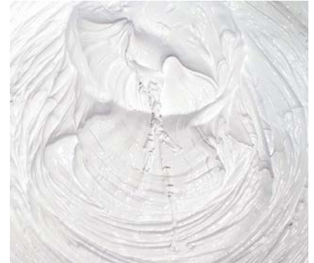
White plastisol ink. International Coatings manufactures a complete line of non-phthalate plastisol and acrysol screen printing inks

PVC plastisols are widely used around the world and are the inks of choice in North America. They are versatile, easy to use, cost efficient and safe. Plastisols don't dry in the screen because they don't cure until they are heated. Plastisols are considered '100% solids' and consequently provide virtually a 100% yield. What you print on the garment