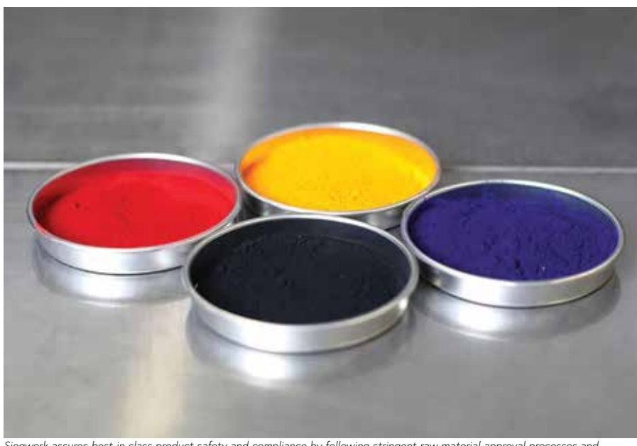
Siegwerk assures best in class product safety and compliance by following stringent raw material approval processes and supporting migration studies

Print quality: is a must-have for flexible packaging, and inkjet is not regarded as highly as flexography or gravure. Of course, ensuring high image resolution, adequate