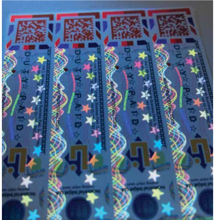
UV-fluorescent print on tax stamps

Another regulatory requirement that impacts packaging is tax stamps for tobacco and alcohol. These now usually require an increase in the level of security of the print by the inclusion of a simple 'covert' code i.e. one printed with an 'invisible' ink such as a UV-fluorescent.