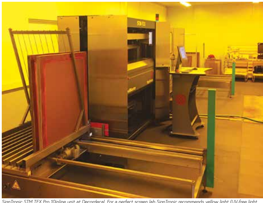
SignTronic STM TEX Pro 10inline unit at Decordecal. For a perfect screen lab SignTronic recommends yellow light (UV-free light conditions)

The opening up of the European market to Asia and the 2008 financial crisis caused a hecatomb at the Portuguese Textile Cluster but a fashion-home-technical response turned this around and emerged as an advanced and competitive industry, anchored in the Textile University & Technologic Centre's ability to increase exports on added-value technical textiles.