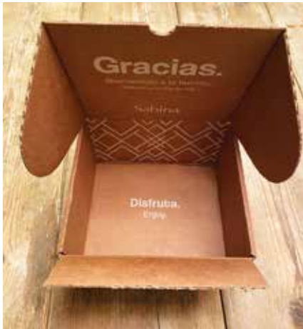
Personalising a brown cardboard box can be done quite simply, yet effectively

come from different suppliers [e.g. Amazon Marketplace] it looks like a single great seller; secondly, there is great attention to the safety of the shipment, and whatever the amount spent, everyone deserves the same level of attention and care.