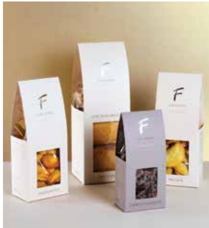
With high-quality packaging the customer's unboxing experience is something that enhances the product

In the past these operations were accessible only to experts but today the market offers software solutions that make packaging customisation a lot easier. Packaging software offers many kinds of boxes for all types of materials; counter and floor displays, advertising totems and in some cases even 3D objects made with