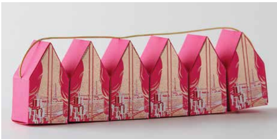
Creative packaging for confectionary

goods with plain boxes or envelopes, but it has decided to have its own packaging with its own graphics. A first sight it might look very basic, but it actually communicates several messages: first of all, even if the product could have