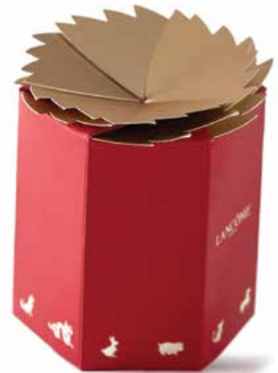
Tactile packaging for high-end cosmetics

Last but not least, never underestimate the emotional factor: being able to create a series of emotional and evocative relationships around a brand becomes fundamental and it is not just a question of