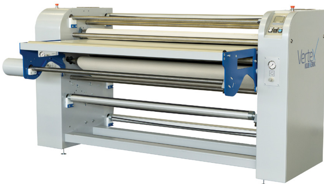
Designed as an entry-level machine, Klieverik's Vertex hybrid transfer calender offers single-piece transfer and roll-to-roll printing